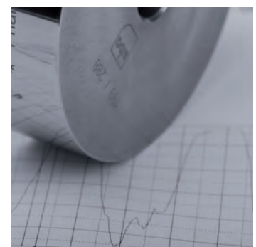
surface quality control

Embossing wheels and segments with raised and sunken characters for the hot stamping of extruded materials.