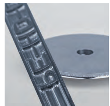
embossing & indenting