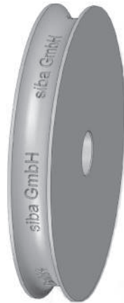
Plane print wheel